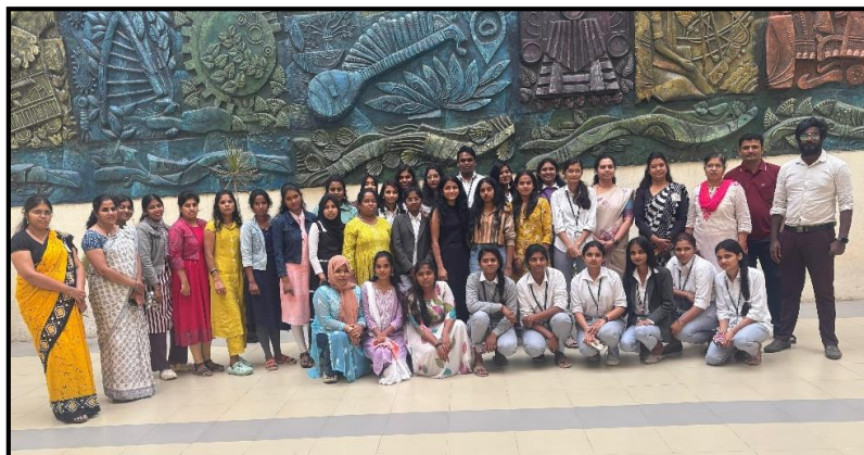
Group picture with USHA Team

The Department of Fashion and Apparel Design at The Oxford College of Science organized a two-day hands-on workshop on USHA Embroidery, Quilting, and Multi-Purpose Sewing Machines for the students. The objective of the workshop was to enhance the technical knowledge and practical skills of budding designers in advanced machine operations, creative stitching, and fabric embellishment techniques. The workshop proved to be highly beneficial, bridging the gap between theory and practice. It not only enriched the students' technical competence but also inspired them to incorporate advanced machine techniques into their design projects. The Department expressed gratitude to USHA for their support and expertise, and to the faculty coordinators for organizing such a fruitful learning experience.