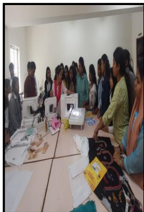
Hands on training on Machine embroidery