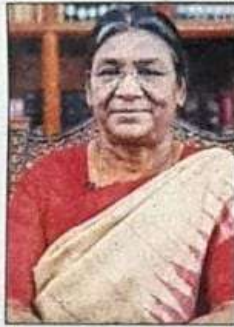
Droupadi Murmu President of India